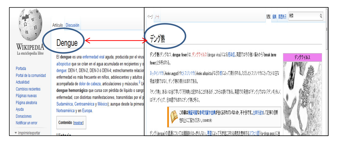
Figure 2 : Wikipedia links.

We eliminated all irrelevant information of each article in Spanish such as tables, special characters, menus, etc.